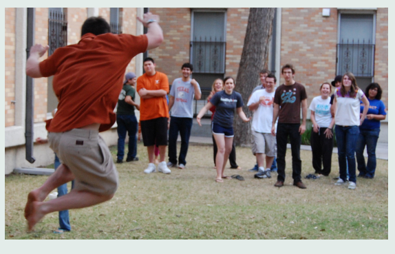
"Through my participation in the ResFIG program, I have come to learn so much about myself and how to form lasting relationships with others."

It's a CONNECTION with experienced students: upper-division peer mentors with inside knowledge of university life.